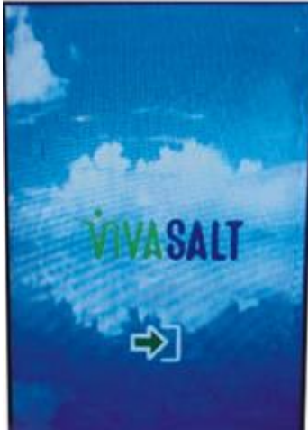
Figure 1: welcome screen

The power cord must be plugged into the outlet. Switch the device on by pressing the switch located on the bottom of the device immediately next to the power cord and the Home screen is displayed (figure 1).